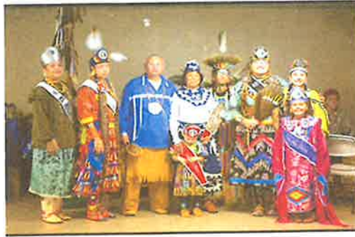
2023-2024 Miss Haliwa Saponi Princess