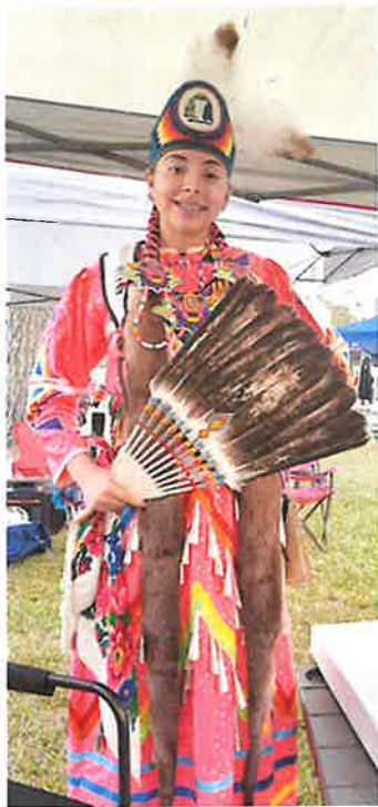
Miss Haliwa-Saponi 2023-2024