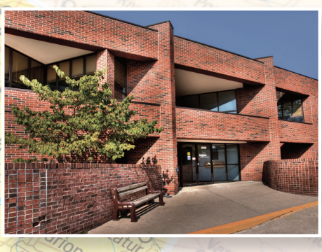
THE CENTER FOR MENTAL HEALTH ANDERSON