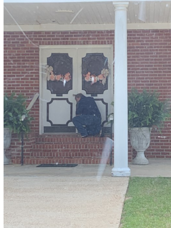
Doty Springs BC