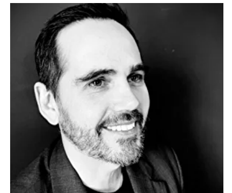
Canary in the Coal Mine page 9