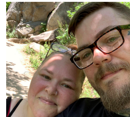
Employee Spotlight page 5