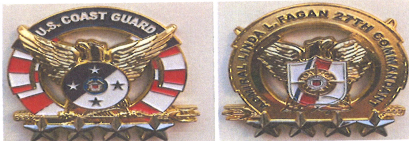
Admiral Linda L. Fagan 27 th Commandant Coin – USCG