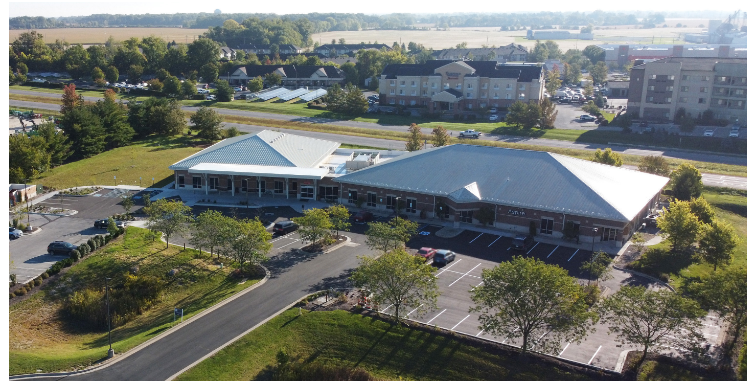
Aspire dedicates expanded Noblesville clinic