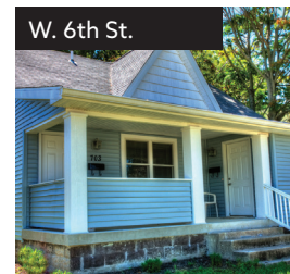
W. 6th St.