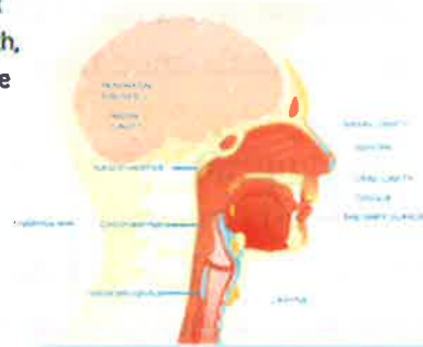
HEAD AND NECK CANCER REGIONS