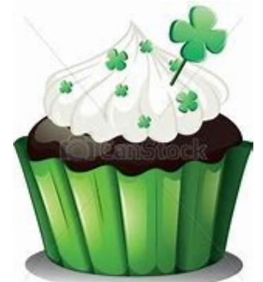
© Can Stock Photo - csp13150030